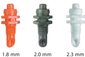
1.8 mm 2.0 mm 2.3 mm