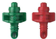
1.3 mm 1.5 mm