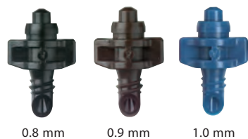
0.8 mm 0.9 mm 1.0 mm