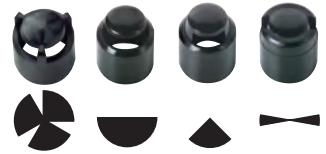
270° (3 x 90°) fan 180° fan 90° fan Strip (2 x 20°)